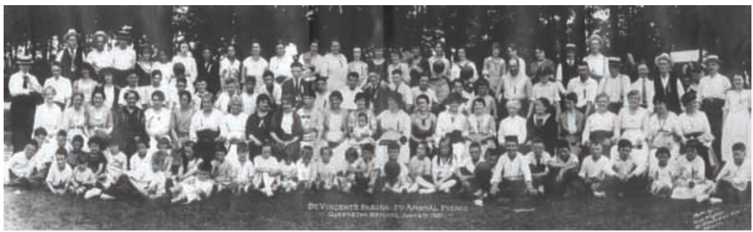
Photo: St. Vincent's Parish, 5th Annual Picnic, Queenston Heights, July 6th, 1921 (See the original in the vestibule)